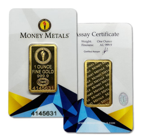
Money Metals offers low-premium gold bars in a wide variety of sizes.

The world's biggest debtor (the U.S. government) is not planning on paying positive real rates to its creditors (bondholders).